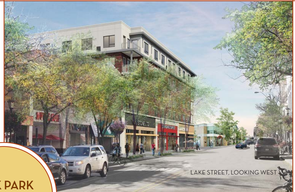
LAKE STREET, LOOKING WEST

Oak Park Station is a transit oriented, mixed-use development that includes 28,209 square feet of newly built ground floor retail space at the base of 271 luxury residential apartments, and a five-level public parking garage with 424 parking spaces. Located in the heart of Downtown Oak Park, retailers will be able to take advantage of the already thriving market that includes nationally recognized brands such as Whole Foods Market, Gap, Old Navy, Lou Malnati's Pizzeria, Trader Joe's, Chipotle, DSW, Ann Taylor and Paper Source. In addition, the development is adjacent to the Oak Park Transit Center with easy access to the CTA Green line, the Metra and eight Pace and CTA buses.